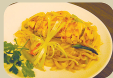
Chicken Yaki Udon

Vegetable & Tofu 14.25 Chicken 17.25 Steak 19.95 Shrimp 19.5