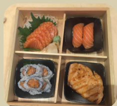
Salmon Lovers Box