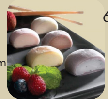
Mochi Ice Cream