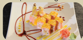
Imperial Mango Roll