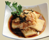
Age Dashi Tofu