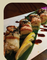
Super Dragon Roll