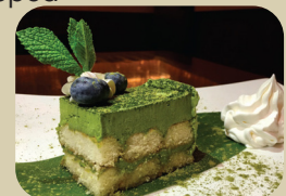
Green Tea Tiramisu