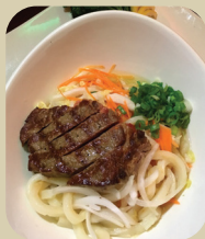
Grilled Beef Udon

Grilled Chicken 17.95 Grilled Beef 19.85 Shrimp Tempura 19.5 Seafood 20.95