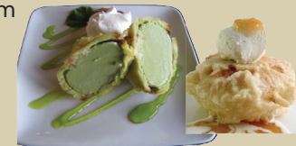
Ice Cream Tempura