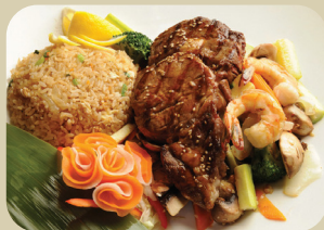
Rib-Eye Steak Hibachi