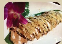
Ultimate Sticky Rice