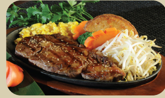
Rib-Eye Steak Teriyaki