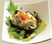
Crabmeat Avocado Salad